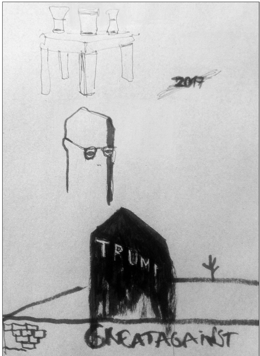
Fig. 4 Maxim Bauer: zeichnerische Dokumentation (drawn documentation), 2017. Pencil on paper. © Maxim Bauer

On a more general level, this brings up the question of responsibility and ethics. A word that keeps crossing my mind when thinking about the films, is “faith.” This is not a very scholarly term, and I have not yet come to a conclusion what my mind wants to tell me with this association. In fact, it makes me feel more comfortable to rephrase it slightly and speak of “trust.” It seems to me that John Smith’s films rely on a contract that implies a basic assumption: We do take the images of The Black Tower as actual images of actual locations in London at an actual point in time in the 1980s. If we had reasons to question the image on this level and to think of it as fabricated, non-representational, “fictional,” the film would be quite pointless.